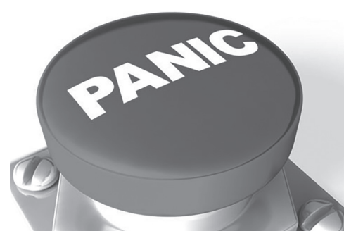
THE iPANIC MAY BE A HIT

Students who are interested or would like more information should sign up or inquire at the help desk in the Jean Anderson Morgan Student Activity Center. Because there are a limited number of packages, students will receive a ticket and must pay attention to the school website and their emails for the winning numbers.