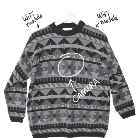
THE NEW iSWEATER

The iSweater for example, will have a built-in body camera that will enable the wearer to record videos for vari-