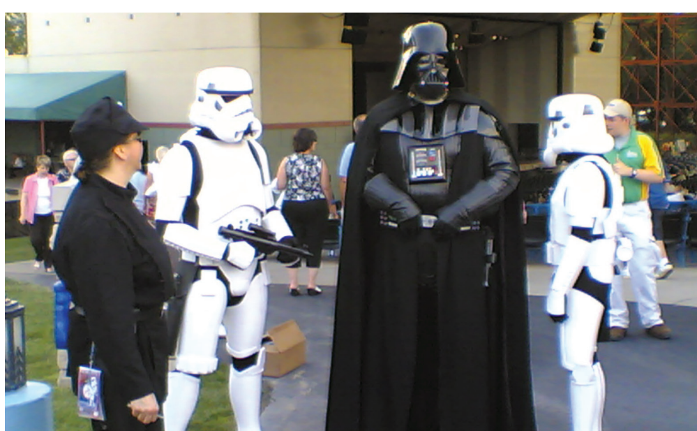
ARE YOU MORE DARTH VADER OR STORMTROOPER?