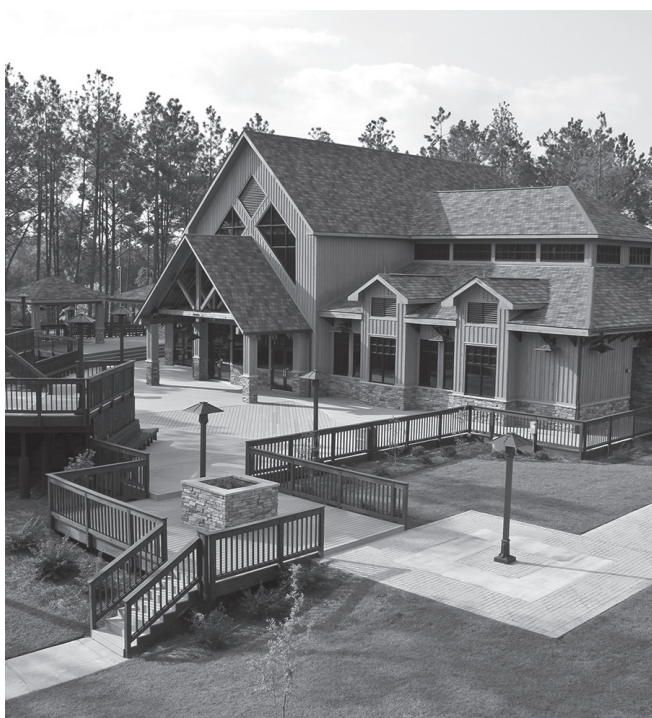
MR. TEMPLETON WENT MISSING FROM THE FULFORD CENTER, SHOWN ABOVE

Mr. Templeton has been in several magazines after winning three competitions including the AFRMA's Best Critter Award. He is a very valuable sire as his offspring sell for more than