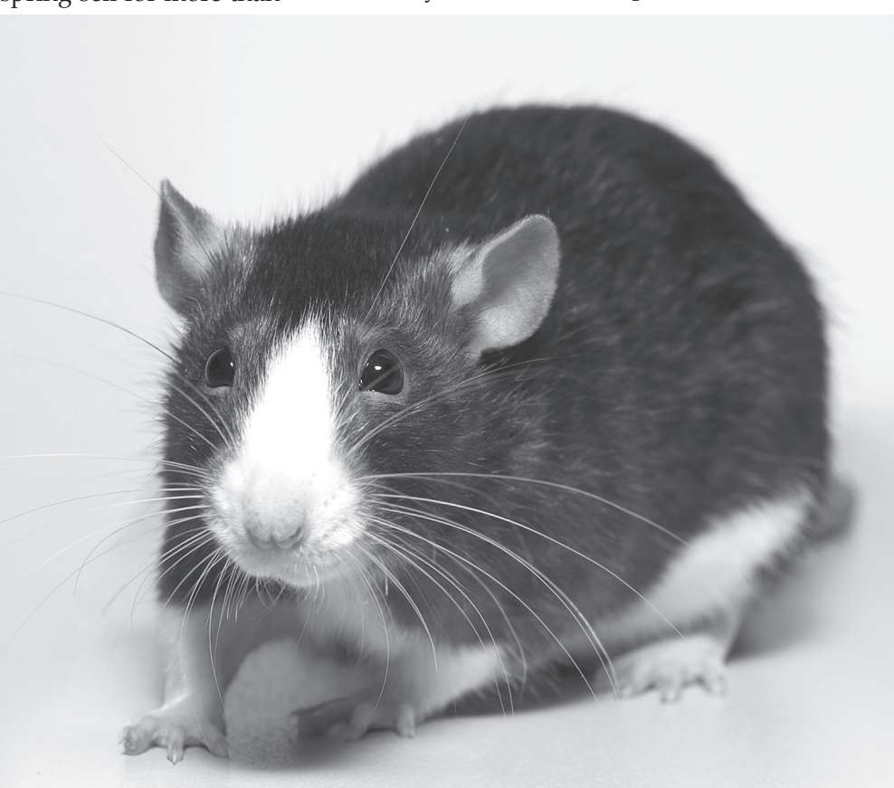
HAVE YOU SEEN MR. TEMPLETON?

Make sure that your friend didn't just get out of an exam or a particularly difficult lab session before shutting them in a closet, however! Zombies and undercaffeinated, over-worked college students sometimes have more in common than you'd think!