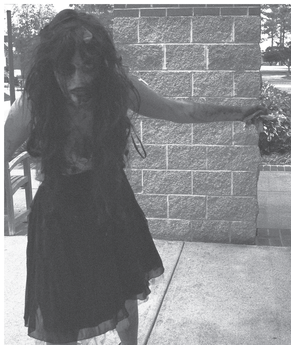
ZOMBIE OR STUDENT LEAVING EXAMS?