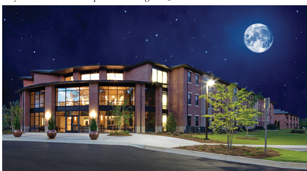
STUDENTS ARE ASKED TO BE IN THEIR ROOMS BY 8 P.M.

The new policy will also be posted on D2L as a reminder before it goes into effect. Afterwards it is your responsibility to remember to be in your room. Please remember the new dormitory rules are only to protect East Georgia's student life, and ensure organized living.