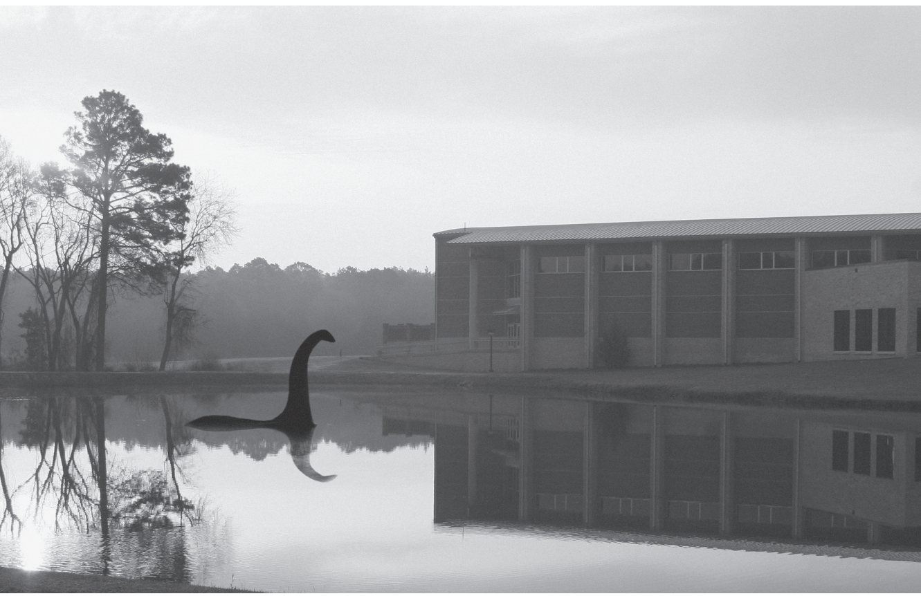
THE ALLEGED "CREATURE IN THE POND"