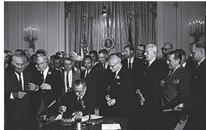
POLITICIANS SIGN OFF ON HEALTH PLAN